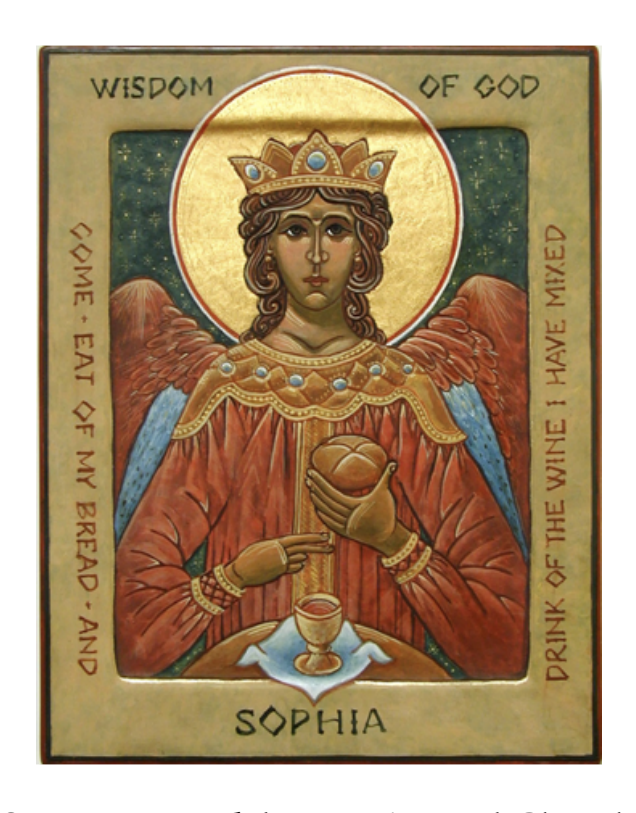
St. Mary Magdalene Episcopal Church